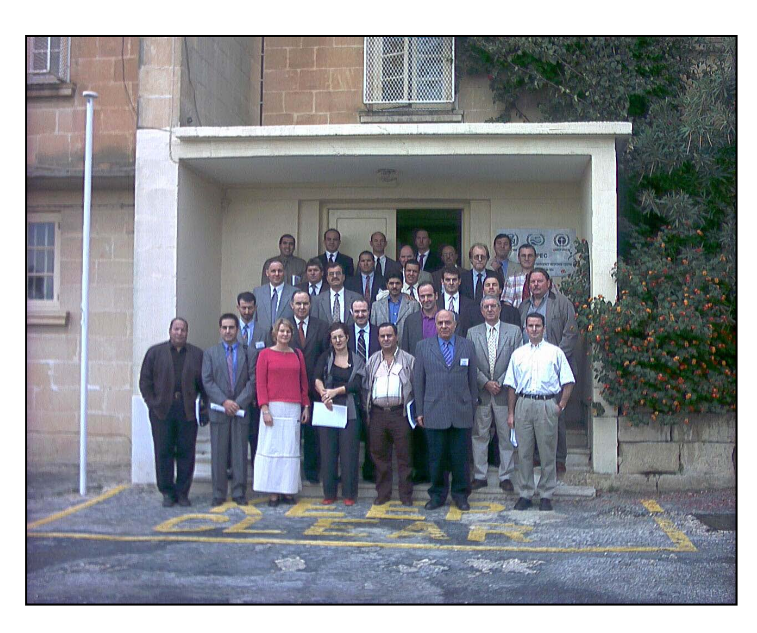
Visit of the participants in MEDIPOL 2002 to REMPEC offices on Saturday, 2 November 2002